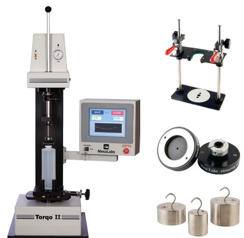
Torqo & Accessories