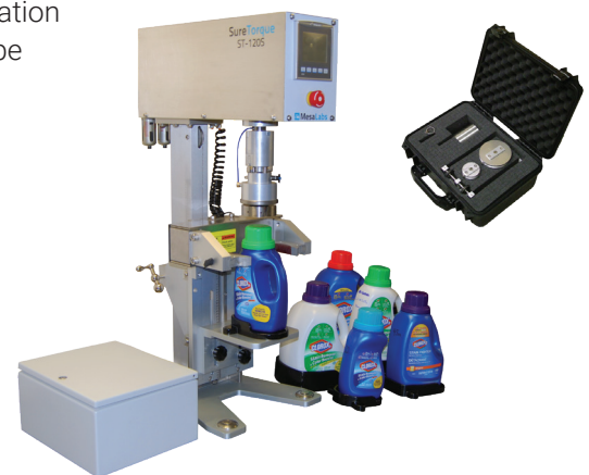
ST-120S & Accessories