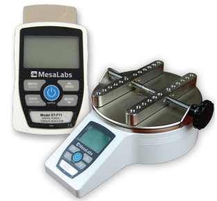
ST-H0X and ST-FT1 Manual Torque Testers

Mesa Labs' ST-FT1 is a universal handheld torque/force display that, when coupled with the Chuck calibrator adapter, can be used to verify/calibrate chuck capper heads. Cap adapters are easily replaceable to accommodate various chucks. Alternatively, the ST-FT can be used with serrated chuck adapters for the purpose of manual torque testing.