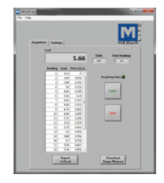
MESUR Lite data acquisition software is included with the ST-FT1