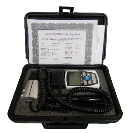
ST-FT1 complete with Calibrator Kit now available

The Plug & Test<sup>™</sup> connector locks into the receptacle in the indicator when fully inserted. Dual buttons on the indicator housing release the connector for easy removal. Gold plated spring contacts ensure long lasting and reliable connection.